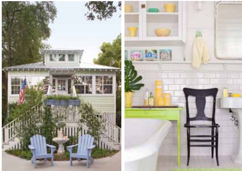
ABOVE LEFT: The relocated raised cottage has new front staircases entwined with fragrant jasmine. ABOVE RIGHT: Subway and mosaic tile give a new bathroom a vintage look enhanced by an old claw-foot bathtub and a pedestal sink, which were reglazed and fitted with vintage-style faucets. BELOW: An attic window seat and a chair slipcovered in a perky stripe welcome Diane's frequent visitors. RIGHT: The living is easy in the cottage's main gathering space, outfitted with comfy slipcovered furniture and a mantel full of treasures.