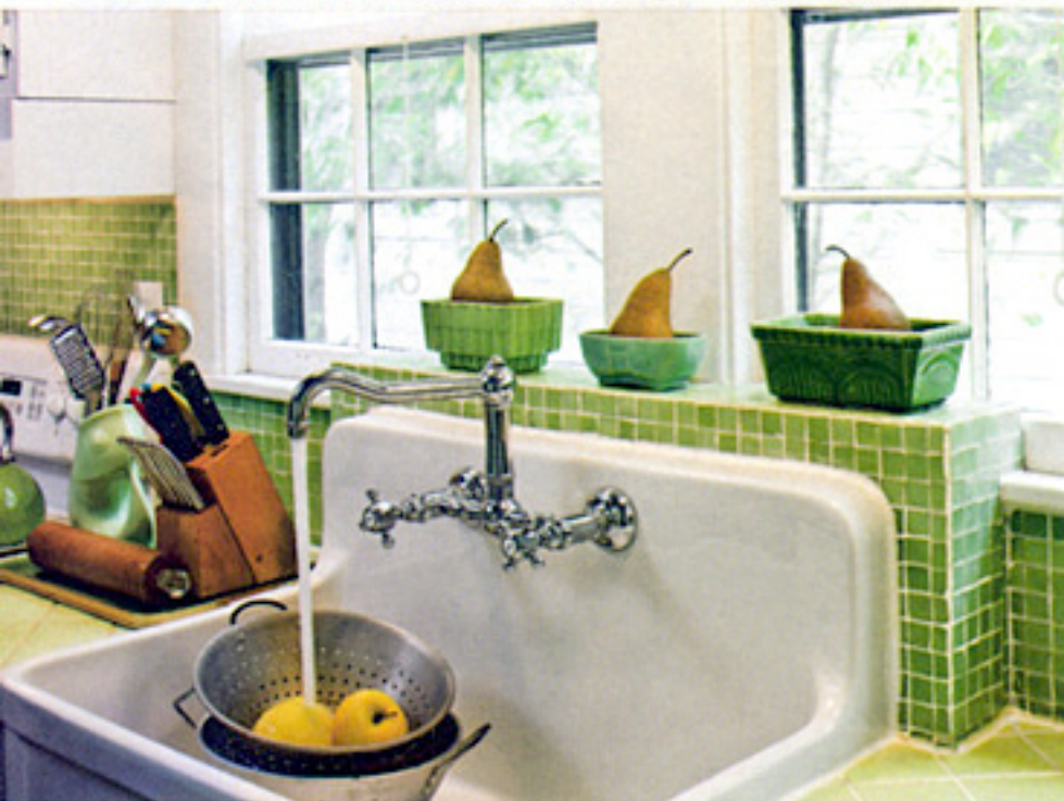
ABOVE: The built-out backsplash helps to accommodate the relatively narrow depth of the reproduction sink (Gilford by Kohler) and provides a useful ledge for display.

well as the charm of its early-20th-century fit and finish. Measuring just 12 x 14 feet, the remodeled space now includes not only the necessities of a modern kitchen but also a full-size washer and dryer. A small, movable island with a butcher-block top was added to compensate for the loss of counterspace sacrificed to the laundry area. Just this tiny bit of added surface makes a huge difference in functionality and—combined with new appliances—fulfills every cooking need from prep to plating.